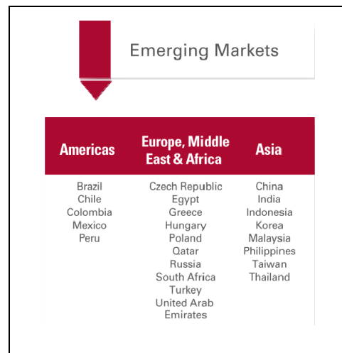
Figure 1. List of Emerging Markets